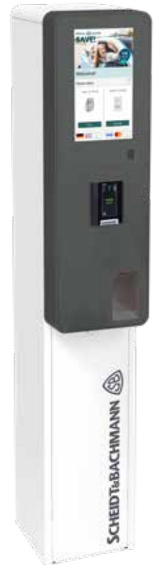
SIQMA OPT 2.0