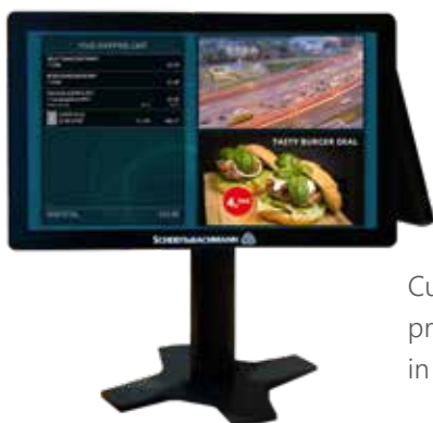
Customer display and promotion integrated in SIQMA Mira

SIQMA BOS enables individual planning for each site. This means that all information is always up to date on a daily basis, without much effort. Everything with just a few clicks!